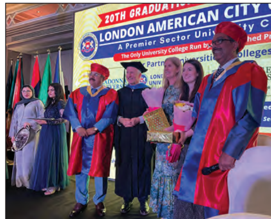
Dubai, UAE 2023 Graduates