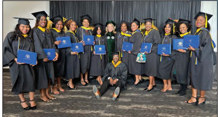
Haiti 2023 Graduates

We are proud to announce the graduation of the 10th cohort from our Haiti program. These exceptional students successfully completed a Bachelor's degree in Business Administration and Leadership while facing difficult challenges of political unrest, hurricanes, and frequent outages of electricity and internet. We look forward to learning of the positive impact they will make in Haiti's future.